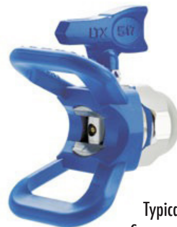
Typical LTX Sprayer Nozzle

The use of spray tip with a smaller orifice will result in less product being delivered to the substrate requiring multiple passes to ensure a complete coating with optimum thickness.