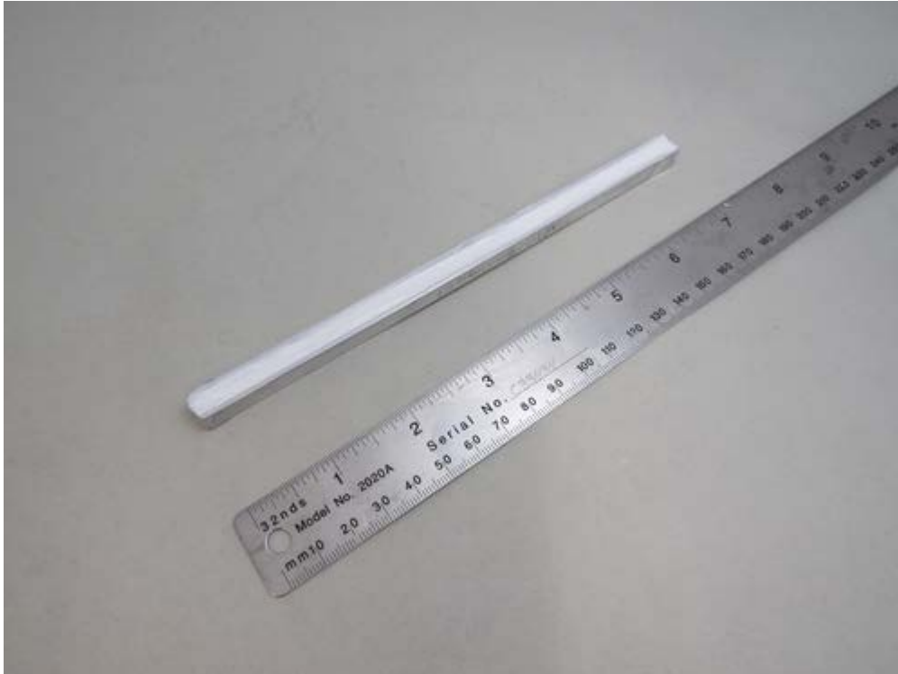
Photo Documentation – The product sample specimen is photographed immediately following specimen preparation and prior to initiating the conditioning period. Typically, the top and bottom faces of the specimen are photographed. Bottom faces may show a stainless-steel plate or other substrate if prescribed by the standard.