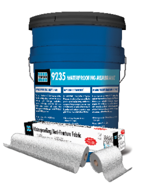
Performance Level: BETTER Warranty: Lifetime Refer to Data Sheets 236.0 and WPAF.5

HYDRO BAN requires no fabric and can be flood tested in 2 hours* after application. HYDRO BAN is IAPMO and ICC approved and offers antifracture protection up to 1/8" (3 mm). Cleans up easily with water.