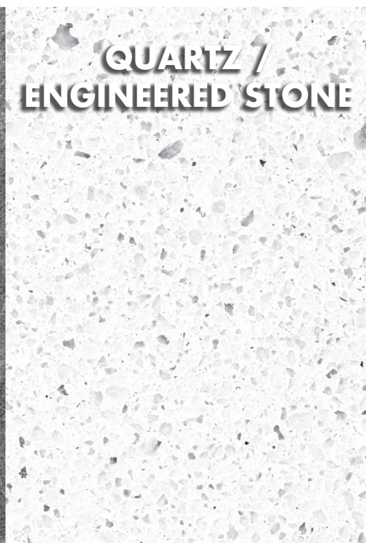
QUARTZ / ENGINEERED STONE