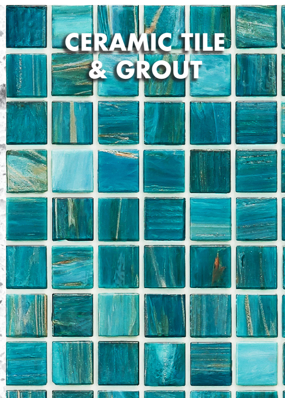
CERAMIC TILE & GROUT