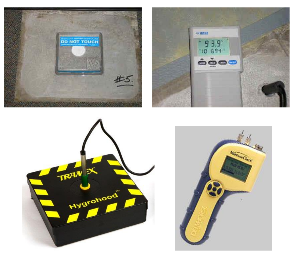
Figure 1.1 – (Clockwise from top left) ASTM F1869 Calcium Chloride Test Kit, ASTM F2170 Relative Humidity Meter, ASTM F2420 Insulated Hood with probe attached, and ASTM F2170 Pin Type Moisture Meter

Concrete contains moisture from the day it is poured and a generally accepted minimum cure time of 28 days is required before a finish material is applied. It may be important to note that 28 days is not a magic number that relates directly to every concrete installation. Simply relying on 28 days can be insufficient and can lead to failure of materials which may be affected by high moisture levels. The cure time of the concrete can vary depending on;