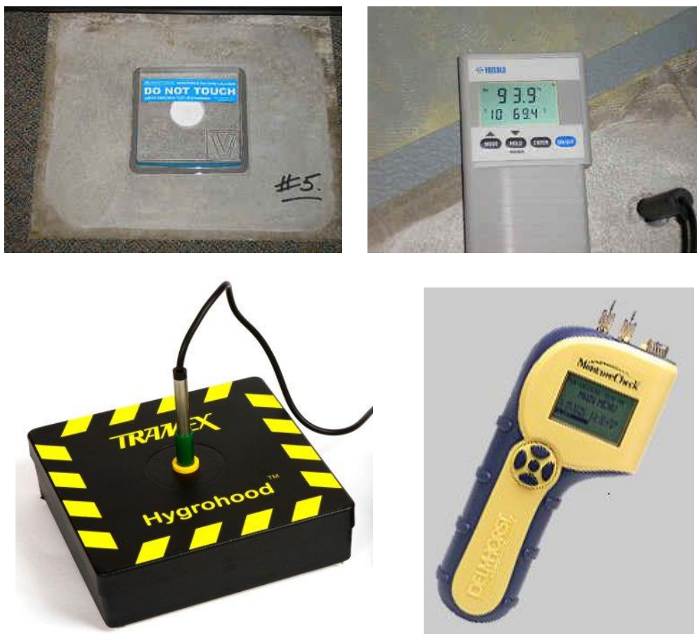
Figure 1.1 – (Clockwise from top left) ASTM F1869 Calcium Chloride Test Kit, ASTM F2170 Relative Humidity Meter, ASTM F2420 Insulated Hood with probe attached, and ASTM F2170 Pin Type Moisture Meter

ASTM F1869, ASTM F2170 and ASTM F2420 are quantitative tests (stating approximately how much moisture is present) while ASTM D4263 is a qualitative test (stating that moisture is present but not how much), and all are a “snapshot” of moisture vapor emission during the testing period.