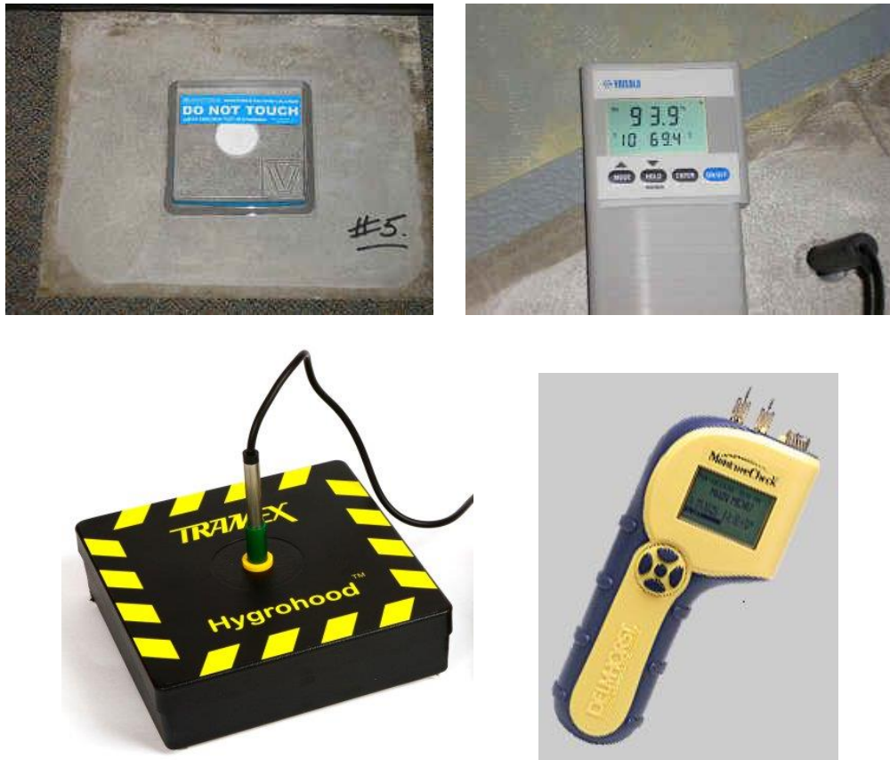
Figure 1.1 – (Clockwise from top left) ASTM F1869 Calcium Chloride Test Kit, ASTM F2170 Relative Humidity Meter, ASTM F2420 Insulated Hood with probe attached, and ASTM F2170 Pin Type Moisture Meter

Concrete contains moisture from the day it is poured and a generally accepted minimum cure time of 28 days is required before a finish material is applied. It may be important to note that 28 days is not a magic number that relates directly to every concrete installation. Simply relying on 28 days can be insufficient and can lead to failure of materials which may be affected by high moisture levels. The cure time of the concrete can vary depending on;