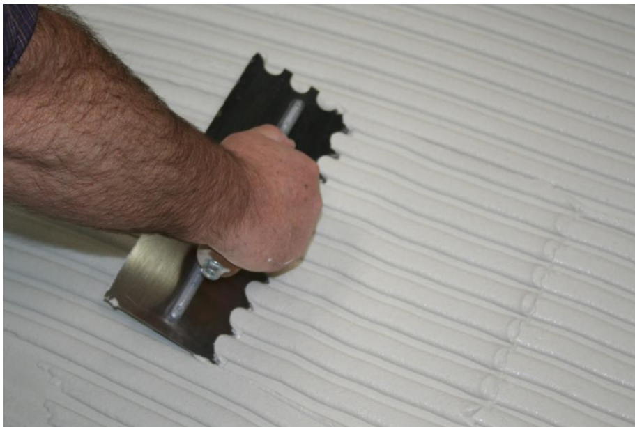
Picture 1.2 - \frac{3}{4} " (18mm) loop notch trowel with a medium bed mortar used for large format tiles or stones. Trowel thin set mortar in one direction holding trowel at a 45 degree angle. Notice the full ribbons of mortar that left behind.

Complete bedding of the tile with the appropriate adhesive mortar is another area that requires attention. Lack of thin set mortar coverage can lead to cracked tile and grout and loss of bond to the tiles. Use the appropriate sized notch trowels (see picture 1.2) for troweling technique) and tap or twist the tiles in place to properly bed the tiles. Large format tiles can be back buttered with additional thin set mortar to ensure that the appropriate coverage is achieved. Notice the lack of coverage in picture 1.3. To correct these errors, carefully remove the grout around the perimeter of the loose tiles and any hardened thin set mortar so as to not disturb any tiles that are still well bonded and then replace using the appropriate troweling technique.