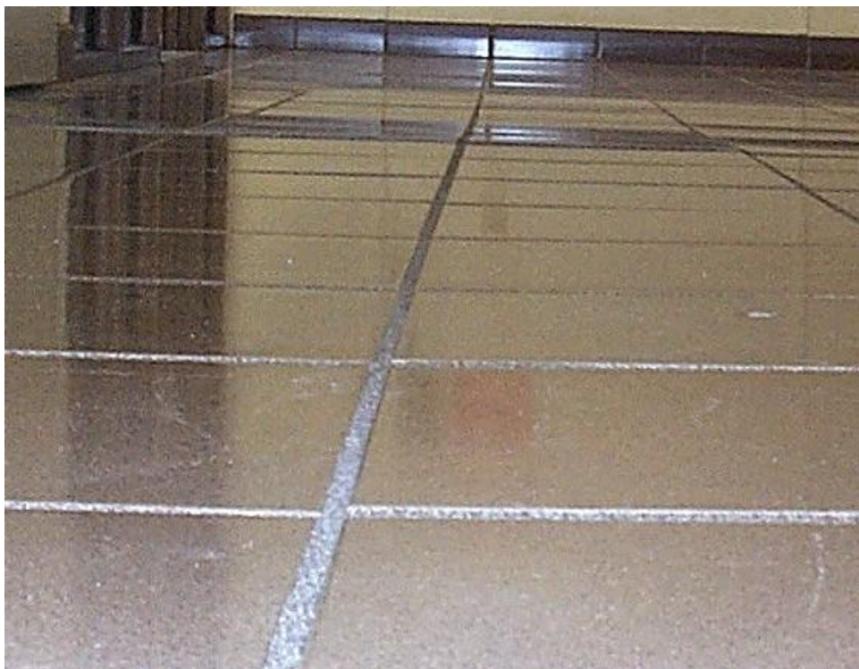
Picture 1-1 – Large format tile highlight imperfections in the substrate.

Specifications for Ceramic Tile. The TCNA (page 34) and ANSI (page 26 – section A108.02 4.3.7) manuals provide information on what the appropriate tolerance levels should be. This discussion deals with the issue of excessive lippage.