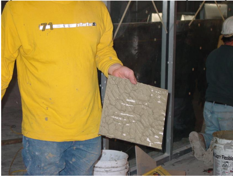
Picture 1.4 – Ceramic tile removed during the installation to verify proper coverage is being attained. Notice the lower right hand corner of the tile is lacking coverage. This will undoubtedly lead to a cracked tile.

1/4" x 4 1/4" (108mm x 108mm) tile; it will not be suitable for installation of 20" x 20" (500mm x 500mm) tile. It is important that this be understood, and that the installer pulls tiles up after they are installed to make sure that the desired