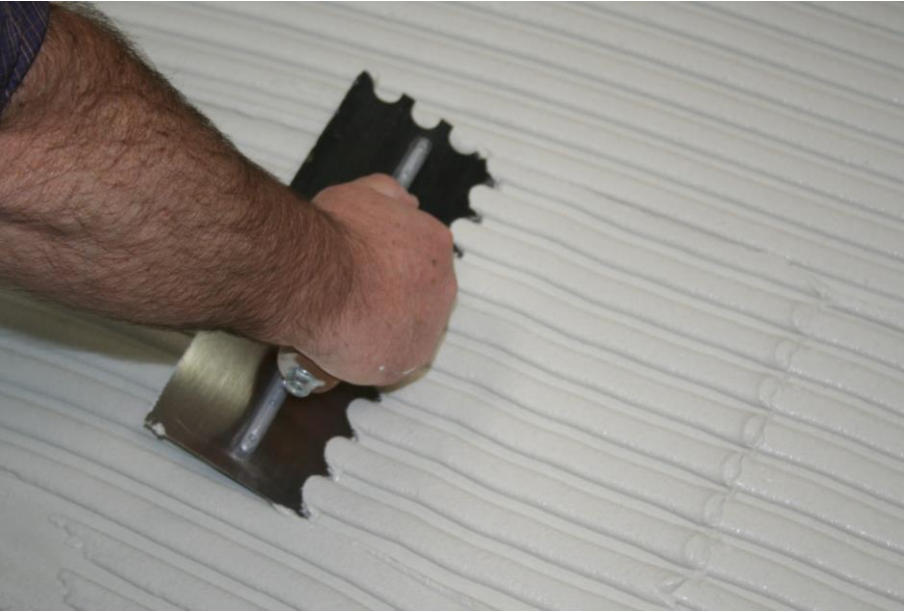
Picture 1.2 - \frac{3}{4} " (18mm) loop notch trowel with a medium bed mortar used for large format tiles or stones. Trowel thin set mortar in one direction holding trowel at a 45° angle. Notice the full ribbons of mortar that left behind.