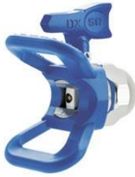
Typical LTX Sprayer Nozzle

Tip Size: LTX525 – has an orifice of 0.025” (0.6mm) and a fan width of 10” (250 mm) holding the nozzle 12” (300 mm) away from the substrate.