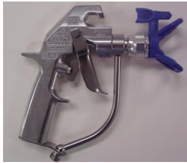
Silver Gun Plus

Follow the specific airless sprayer and spray gun manufacturer's written instructions when using their specific equipment. The Graco Silver Gun Plus ® is depicted in the following photo. This spray gun can be used for both vertical and horizontal applications. Some Spray Guns will allow filtering in the gun handle. The filters will need to be periodically cleaned and changed to ensure proper liquid flow through the spray gun and tip.